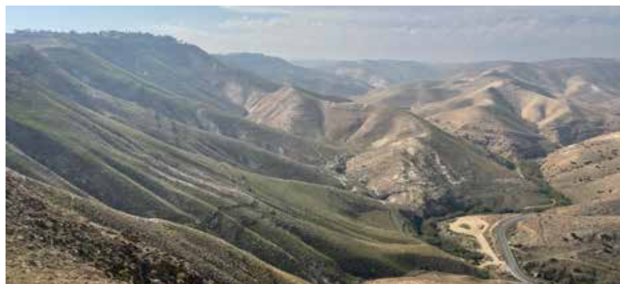
The Judean wilderness

At the core of the church's own framework for understanding human sin and suffering is Christ's passion and crucifixion at the hands of a brutal occupying force and vengeful religious scapegoaters. This year the events of Holy Week and especially Good Friday will take place under the gloom of war and the terrible suffering of the people of Gaza, not only bombed but also increasingly, starved to death. We say and we will sing 'Is it nothing to you all who pass by?' As we imagined Christ born under Gaza's rubble, we will also consider, Jesus crucified in Gaza. Please do not speak to me about hope as if it were just a cheap optimism for a better day. Christian hope is that for Jesus, resurrection followed crucifixion but it does not remove the reality of the suffering of the cross. It helps us to look through the cross to the enduring love of God in the present life and in the life to come.